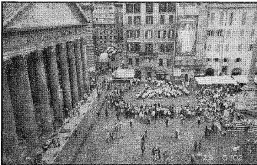
The Square in front of the Pantheon.

Last May, shortly after NAPPS' 20th Anniversary Conference, several NAPPS Members traveled to Rome, at their own expense, to attend a meeting of our European counterparts, the Union Internationale des Huissiers de Justice (UIHJ). Thanks to Alan Crowe for submitting the following photos.